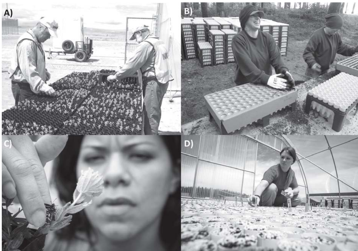
Figure 2. Prison inmate technicians participating in conservation projects. (A) Adults in custody cultivating sagebrush ( Artemisia tridentata ) at Snake River Correctional Institution near Ontario, Oregon. Plants produced at this facility are planted by inmate work crews at restoration sites to improve habitat for greater sage-grouse ( Centrocercus urophasianus ) (photo by Stacy Moore). (B) Production of early blue violet ( Viola adunca ) at the Coffee Creek Correctional Facility to support habitat restoration and feeding of captive reared Oregon silverspot butterflies ( Speyeria zerene hippolyta ) (photo by Thomas Kaye). (C) An inmate with SPP-Washington Taylor's Checkerspot Captive Rearing Program at Mission Creek Corrections Center for Women holds an endangered Taylor's checkerspot butterfly ( Euphydryas editha taylori ) next to golden paintbrush ( Castilleja levisecta ) during a study of the butterfly's oviposition preferences (photo by Benj Drummond). (D) An inmate technician labels native prairie plants for the SPP-Washington Conservation Nursery Program at Washington Corrections Center for Women (photo by Benj Drummond).

Coffee Creek Correctional Facility for women, a medium- and minimum-security prison in Wilsonville, Oregon (Figure 2B). Violet plants are also grown at the Oak Creek Correctional Facility for young women in Oregon, a facility managed by the Oregon Youth Authority. This project is a partnership between the Oregon Department of Corrections, Institute for Applied Ecology, Oregon Youth Authority, and the Oregon Zoo. A lecture series on habitat and animal conservation is provided to inmates in the women's prison and young women receiving high school science classes at the youth facility. Biologists from the Institute for Applied Ecology work closely with the staff and offenders at both correctional facilities to ensure proper cultivation practices for the violet