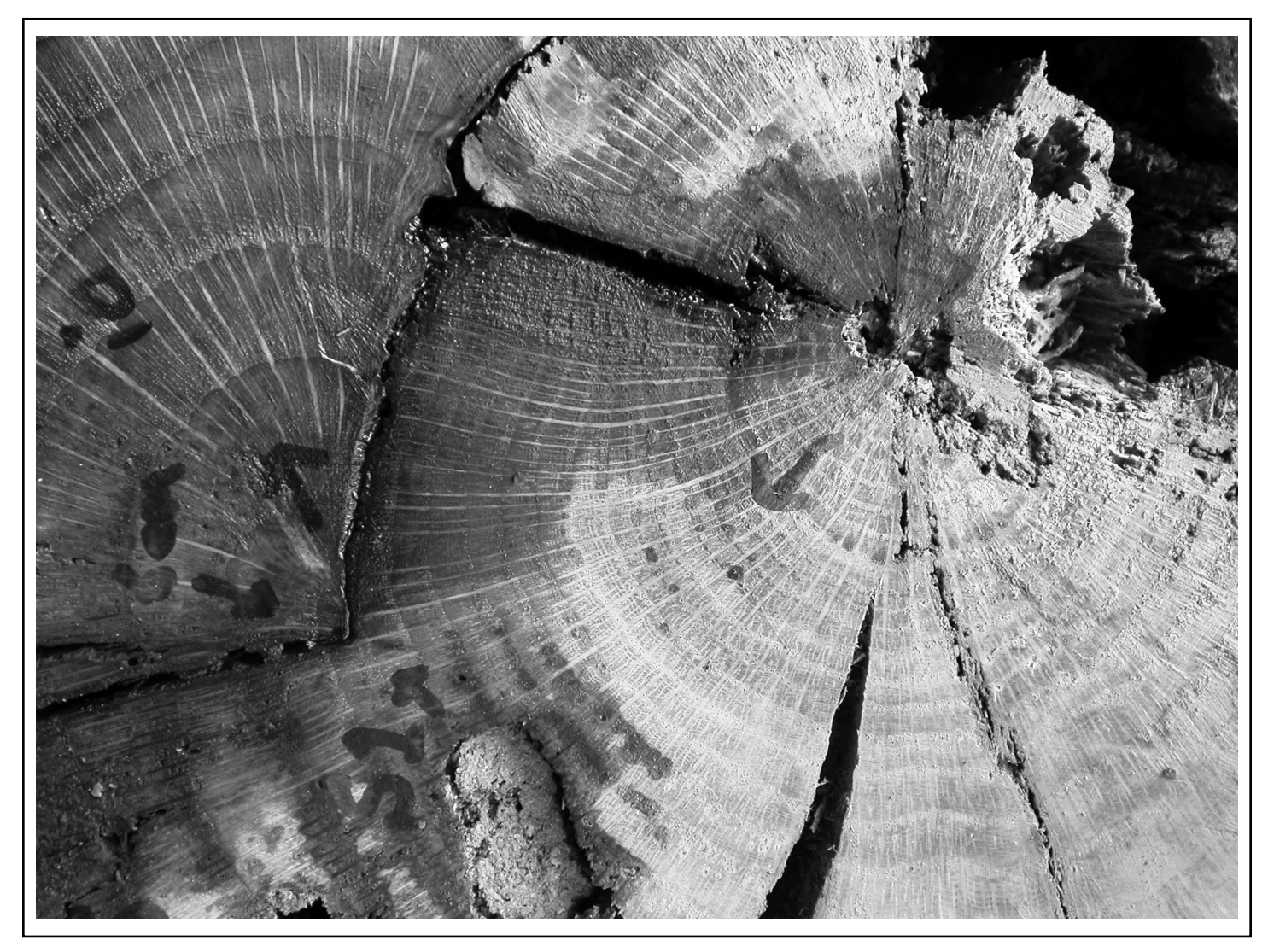
Figure 2. Example of fire scarring within a black oak cross-section (S7 in Figure 1), collected in 2009, High Park, Toronto. Subsequent ring growth exhibited sealing over the scar and an episode of increased ring width.

individuals in a burn. We therefore used the following corroborative fire event indicators: (1) the timing of establishment of multistemmed individuals (three of the 14 cross-sectioned individuals), which, among oaks, indicates basal resprouting in response to having been top-killed as a sapling, typically by fire or other disturbance (Keeley 1992; Del Tredici 2001), and (2) the presence of even-age cohorts in the pre-settlement period, which is suggestive of a fire-induced recruitment period (Abrams 1992; Peterson and Reich 2001). Our sample of cross-sections was also used to determine establishment dates (n = 14). With respect to multistemmed individuals, resprouting following fire disturbance occurs simultaneously across all