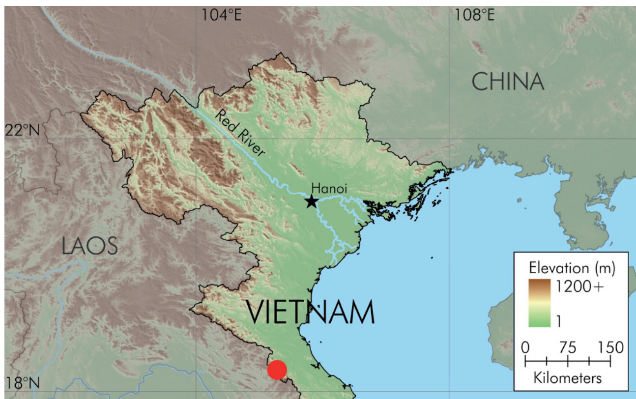
Fig. 1. Map showing the type locality of Vietnamophryne vuquangensis sp. nov. (red circle) in Vu Quang NP, Ha Tinh Province, Vietnam.

Extraction of genomic DNA from 13 tissue samples (Table 1) was carried out using TIANamp Genomic DNA kit (TIANGEN BIOTECH, Beijing, China), Tiangen following the manufacturer's instructions. Total DNA was amplified using an Eppendorf PCR machine. PCR total volume was 25 \mu l, consisting of 12 \mu l of Mastermix, 6 \mu l of water, 1 \mu l of each primer at a concentration of 10 pmol/ \mu l, and 5 \mu l of DNA. Primers used in the PCR and sequencing were as follows: 12SAL (5'-AAACTGGGATTAGATACCCCACTAT-3'; forward), 16S2000H (5'-GTGATTAYGCTACCTTTGCACGGT-3'; reverse) (Zhang et al. , 2008) and LR-N-13398 (5'-CGCCTGTTTACCAAAAACAT -3'; forward), LR-J 12887 (5'-CCGGTCTGAACTCAGATCACGT -3'; reverse) (Simon, 1994). PCR conditions: 94°C for 5 minutes of initial denaturation; with 35 cycles of denaturation at 94°C for 30 s, annealing at 56°C for 30 s, and extension at 72°C for 45 s; and the final extension at 72°C for 7 minutes. PCR products were sent to Tsingke Biological Technology company for sequencing ( http://www.tsingke.net ). The obtained sequences were deposited in GenBank under the accession numbers MW763017 to MW763029 (Table 1). We amplified a 1940 base pair (bp) length fragment of the 12S rRNA–