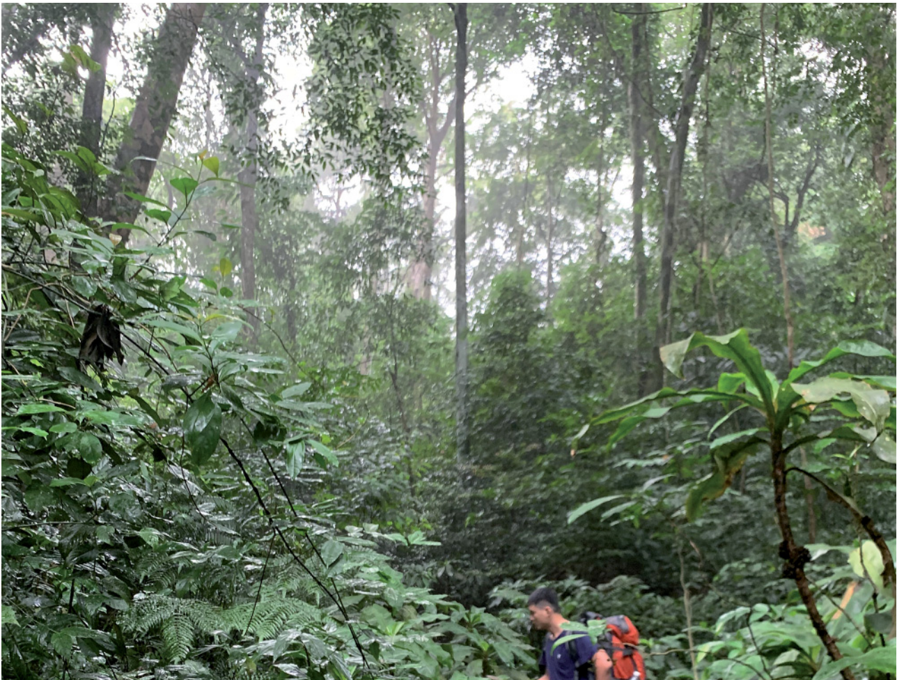
Fig. 6. Habitat of Vietnamophryne vuquangensis sp. nov. at the type locality in Vu Quang National Park, Ha Tinh Province, Vietnam.

V. orlovi by eye to nostril distance almost equal to eye length (N-EL/EL 111%). Eye to nostril distance in V. inexpectata (N-EL/EL 48.1%) and V. occidentalis (N-EL/EL 56%) is equivalent.