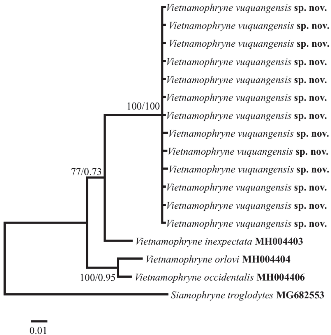
Fig. 2. Bayesian inference (BI) tree based on the partial 16S rRNA mitochondrial gene. Values at nodes correspond to BI/ML support values, respectively. Numbers above and under branches are ML bootstrap values and Bayesian posterior probabilities. Siamophryne troglodytes are used as the outgroup.