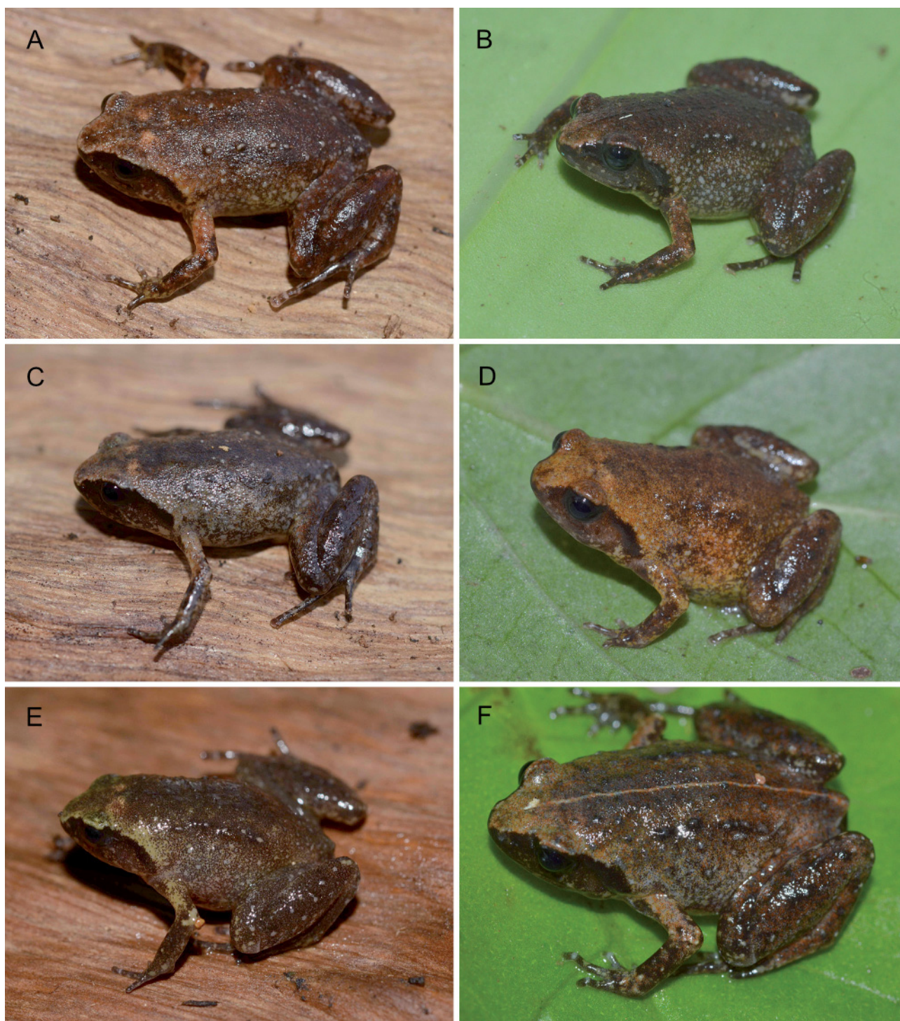
Fig. 5. Paratypes of Vietnamophryne vuquangensis sp. nov. (A) VNMN 010487, (B) VNMN 010491, (C) VNMN 010519, (D) VNMN 010518, (E) VNMN 010490, (F) VNMN 010521.