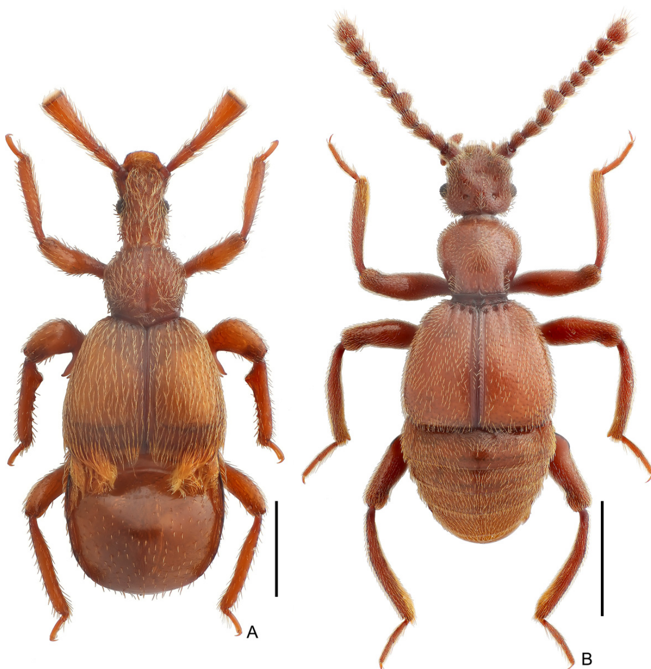
Fig 1. Dorsal habitus of two new species: (A) Diartiger jiquanyui sp. nov. (B) Myrmicophila yulong sp. nov. Scale bars: 0.5 mm in A, 1 mm in B.

Description: Male (Fig. 1A). Body length (combined length of head, pronotum, elytra and abdomen) 2.41–2.42 mm, colour reddish-brown.