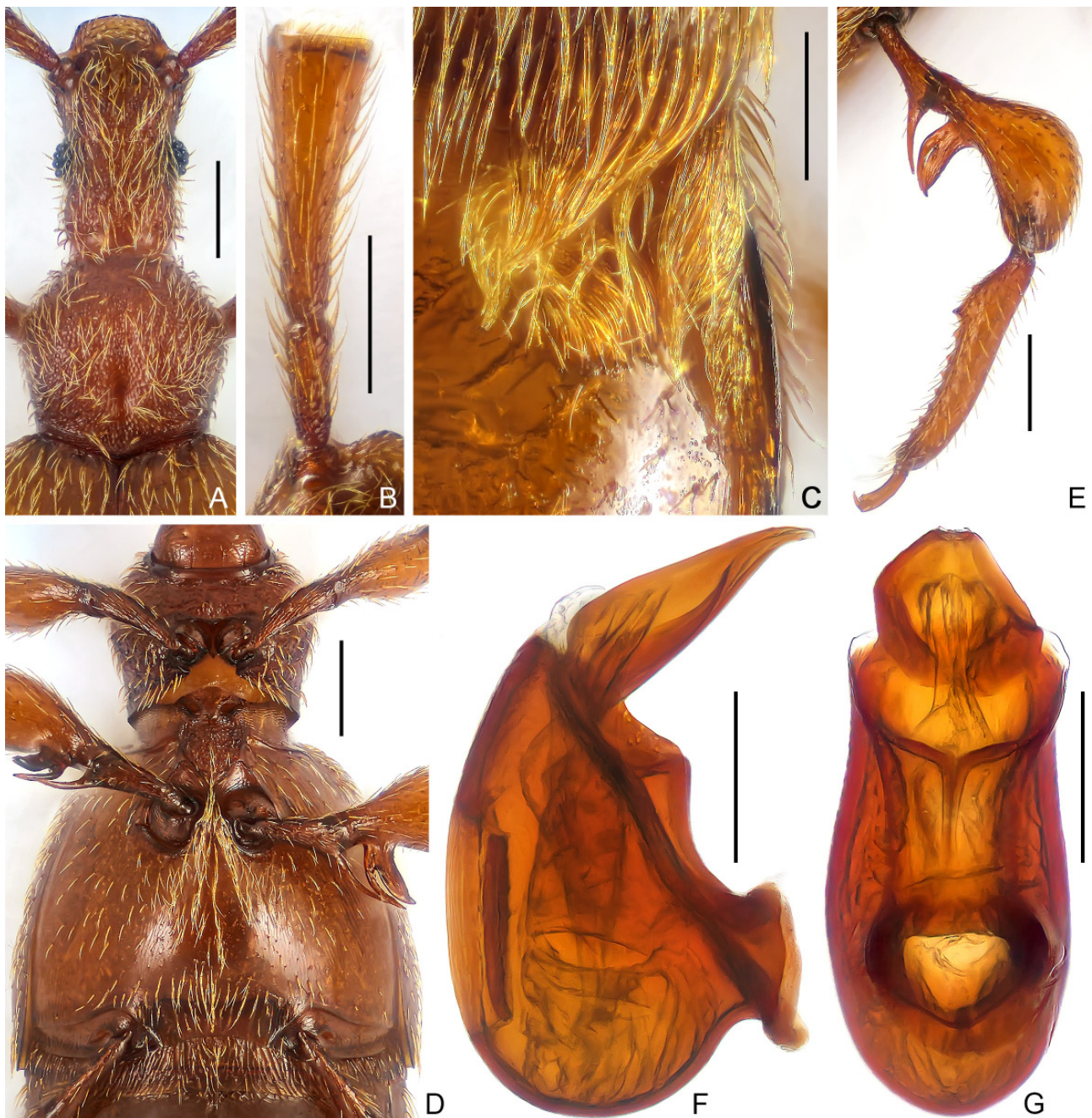
Fig. 2. Diagnostic characters of Diartiger jiquanyui sp. nov. (A) Head, pronotum, and elytral base. (B) Left antennomeres 2-4. (C) Trichomes on elytral and abdominal bases. (D) Prosternum and meso- and metaventrites. (E) Mesotrochanters, mesofemur and mesotibia. (F, G) Aedeagus, in lateral (F), and ventral (G) view. Scale bars: 0.2 mm in A, B, D, E; 0.1 mm in C, F, G.

Elytra much broader than long (Fig. 1A), length along suture 0.64-0.65 mm, maximum width 0.86-0.87 mm; with linear microsculpture on disc, and long setae