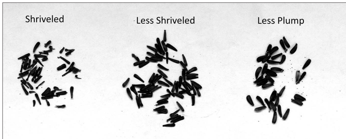
Figure 2. Seed morphological categories. Harvested seeds were separated into four categories according to physical attributes delineating probable viability: shriveled, less shriveled, less plump, and plump. Shriveling was the main characteristic taken into account, along with coloration and the shape of the ends of the seed coat. Shriveled seeds were often discolored brown, while other categories were dark gray. Furthermore, the plumper seeds were, the rounder and more full they appeared.