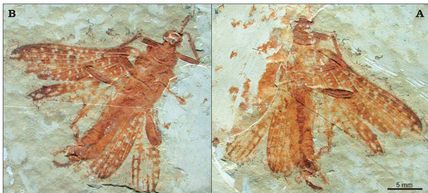
Fig. 1. Susumaniid stick insect Renphasma sinica gen. et sp. nov., holotype A31857, Beipiao City, China, Lower Cretaceous, Yixian Formation. Photographs of print (A) and counterprint (B).

straight, reaching posterior wing margin, a weak but poorly preserved anterior branch of CuP reaching MP+CuA very near to its base; two simple and straight anal veins, anal area 1.3 mm wide.