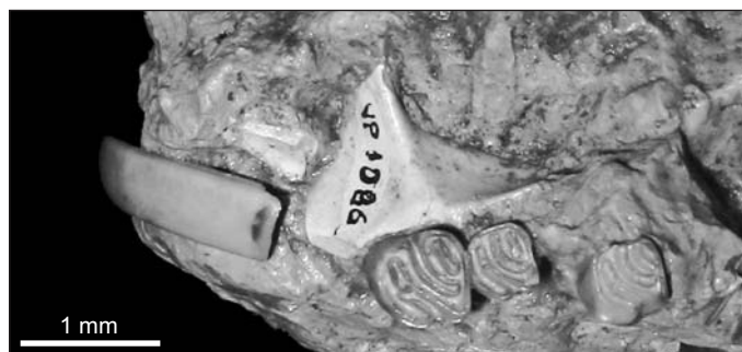
Fig. 1. IPS 31102, a left maxillary fragment with the upper incisor and P4–M2 of the castorid Chalicomys catalaunicus (Bataller, 1838) from Sant Quirze (MN7+8 from the Vallès-Penedès Basin, Catalonia, Spain). Note the abundant cement infilling all synclines.

comys but shows a markedly reduced M3. Huguency (1999) noted that some molars of Schreuderia adroveri and Chalicomys catalaunicus show a tendency to display an S-pattern, leading her to place them into the same subgenus, which she considered to be related to castoroidines. This was later disputed by Korth (2001), who considered Schreuderia to be a castorine, probably even a subgenus of Chalicomys . Certainly, a few molars of C. catalaunicus display a tendency towards an S-pattern at particular wear stages, but generally the occlusal pattern is castorine-like. Moreover, the cheek teeth are hypsodont and the striae/iids are longer than in Steneofiber depereti , further displaying abundant cement in all the synclines/ids (Fig. 1; see also Crusafont Pairó et al. 1948: pls. 5–8). These features strongly support the inclusion of this taxon in Chalicomys as a distinct and rather small-sized species, which partially overlaps with S. depereti but tends to be somewhat larger (Fig. 2). A revision of the type species is clearly needed in order to assess the validity of the (sub)genus Schreuderia .