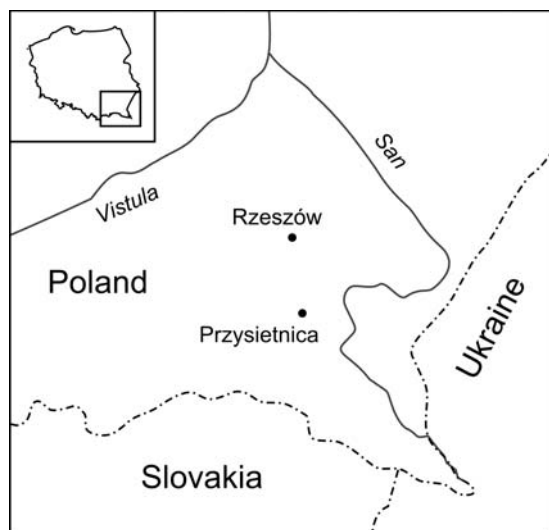
Fig. 1. Location of the village of Przysietnica in southeastern Poland, where the specimen ZPALWr. A/4004 was found.

dicating the IPM4A Zone (Kotlarczyk et al. 2006: fig. 6). The fossiliferous horizon of Przysietnica (PS-5) has been dated to Rupelian, early Oligocene, circa 29 Mya, on the basis of the fish assemblage indicating the IPM4A Zone, and correlated with the calcareous nannoplankton of the NP24 Zone sensu Berggren et al. (1995). The fossil-bearing section at Przysietnica is currently referred to the Šitbořice Member of the Subsilesian Unit of the Menilite Formation of the Polish Outer Carpathians (Kotlarczyk et al. 2006: 16, 96).