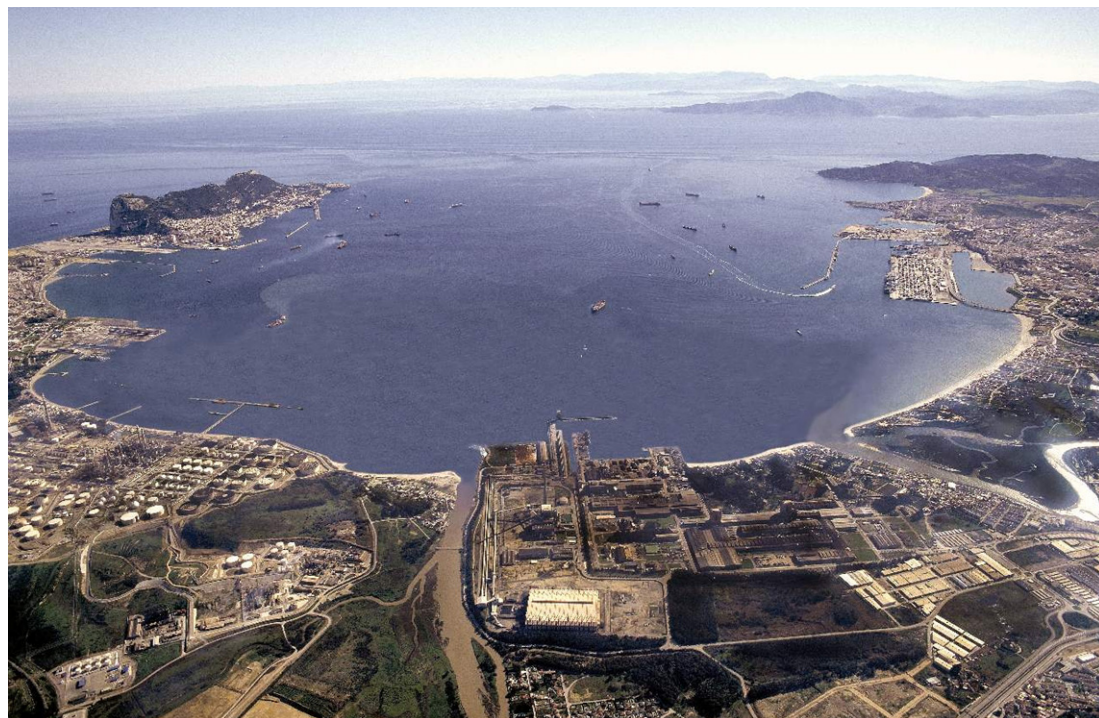
Figure 1. View of the study area with Gibraltar to the left, Spain to the right and in the foreground. Beyond the Strait the coast of North Africa is visible.

may provide useful information on population trends, provided that sufficient observations are made over a long-enough period. This paper presents such information based on the data collected at Gibraltar.