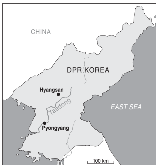
Figure 1. Survey sites during 1999–2004 were located in Pyongyang (Diplomatic Compound, Moran-bong Park, Munsu-bong Park, Taedong-gang) and Hyangsan (including the Myohyang mountains).

Birds were surveyed through direct field observation at several sites (Fig. 1) between April 1999 and November 2004, the intensity increasing until 2003 (number of days with at least several hours of observation: 14 in 1999; 60 in 2000; 137 plus two from R.J. Tizard in 2001; 219 plus 13 in 2002; 247 in 2003; and 52 in 2004). In Pyongyang, observations were spread in all weeks of the year, and in Hyangsan in most weeks, excepting some of January and August and most of February. Standardised routes were followed each day at Moran, Munsu and Hyangsan, allowing comparison of counts between days within each site; but routes varied along the Taedong. Myohyang was visited less regularly, but multi-day forays deep into the protected area, across its entire altitudinal range (100–1909 m), were spread across the breeding season. Chief characteristics of each site are given in Duckworth (2006: Table 1). Arctic Warbler is very similar in plumage to Greenish Warbler P. trochiloides plumbeitarsus (Beaman & Madge 1998), a locally common breeder in Myohyang's higher altitudes, and rare passage migrant through Pyongyang (own data). Silent birds may elude certain identification, but song and calls allow easy identification (e.g. Lekagul &