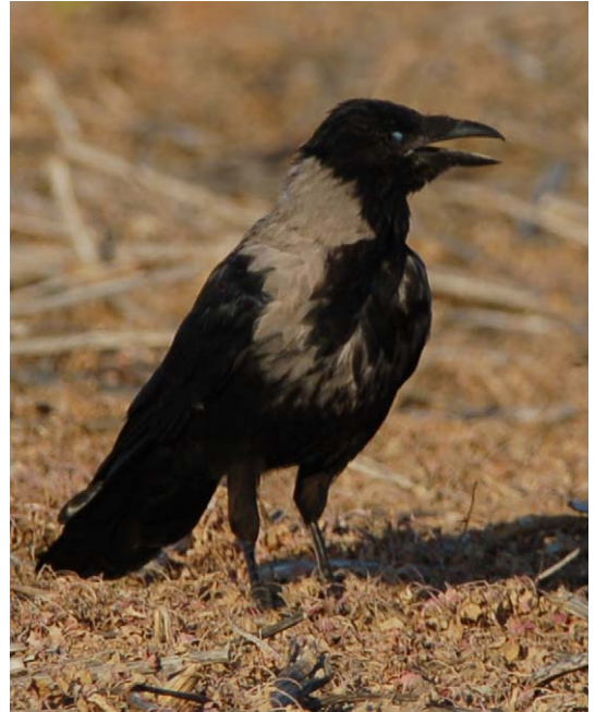
Figure 2. 'Hooded-type' hybrid between Carrion and Hooded Crow.

I used expected frequencies as calculated following the methods proposed by Rolando (1993). For each 18 x 18 km grid cell, I calculated the expected frequencies assuming that the sampling probability for each mate is independent of that of the other (Rolando 1993). The expected frequencies were calculated from numbers of phenotypes in pairs occurring in each grid cell (details in Rolando 1993, p. 81). Assume, for example, in one grid cell the proportion of Carrion and Hooded Crows were 0.40 and 0.60, with 10 pairs observed. Accordingly, the expected frequency of Hooded x Hooded pairs was 3.6 ( 0.6 \times 0.6 \times 10 ), that of Carrion x Carrion was 1.6 ( 0.4 \times 0.4 \times 10 ) and that of Carrion x Hooded was 4.8 ( 0.6 \times 0.4 \times 2 \times 10 ). The expected frequencies for each grid cell were added and compared with the observed frequencies of the total area. To compare expected with observed frequencies, I used the G-test (Sokal & Rohlf 1991) in a spreadsheet version provided by John H. McDonald (for more details see: http://udel.edu/~mcdonald/statgtestgof.html ). All tests were two-tailed.