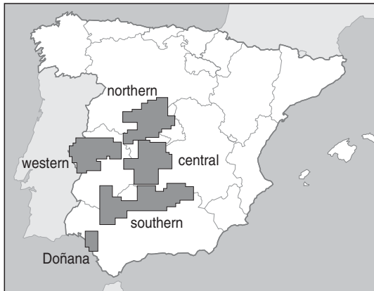
Figure 1. Outline of Spanish Imperial Eagle populations considered in the present study.

age-class of the birds based on their plumages (González 1991, González et al. 2008). Individuals in adult plumage (age class >5.5 years old) and in subadult plumage (age class 4.5–5.5 years old, because most of these individuals reproduced, unlike younger age classes) were considered to be adults and individuals in the age-classes of 1.0–4.5 years were considered non-adults . In order to detect the formation of new pairs, we monitored peripheral areas adjacent to the nuclei with potential habitat for the species on an annual basis (González et al. 2006, González et al. 2008).