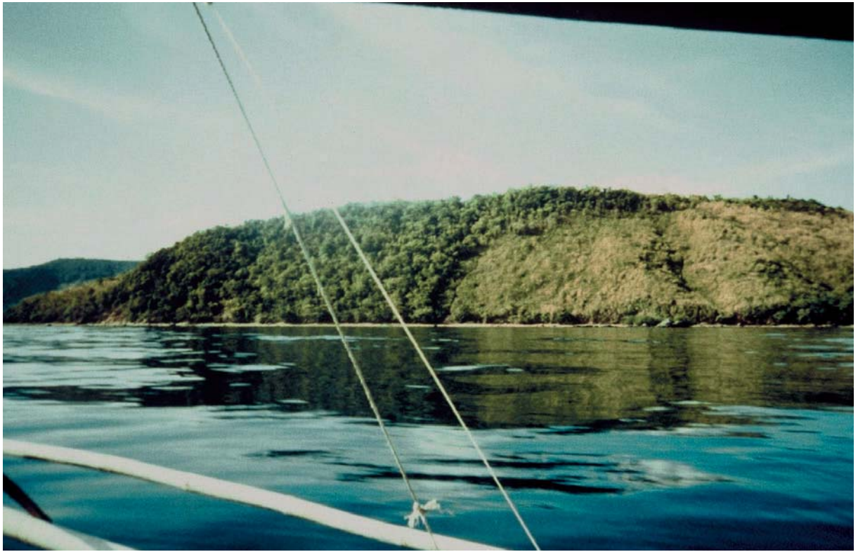
Figure 3. An example of clear-felling (right-hand hillside) resulting in habitat fragmentation. Busuanga Island, north of Palawan, Philippines.

wrote “unless immediate and urgent action is taken, not only birds but all other Philippine wildlife species are likely to become threatened or even extinct.”