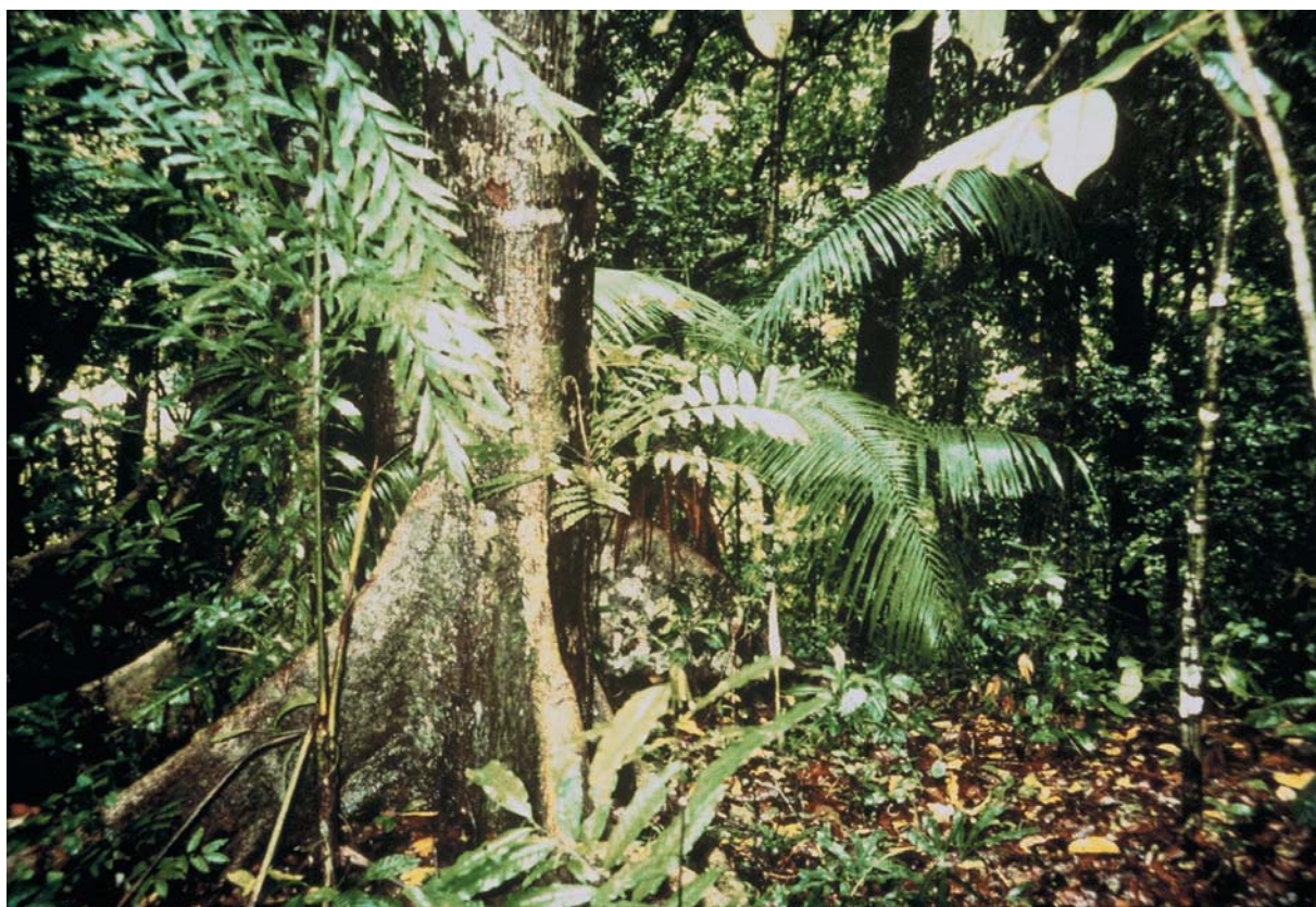
Figure 2. Old-growth forest, typified by giant-sized, buttress-rooted Dipterocarps once covered virtually all lowland areas of the Philippines. Less than 10% now remains. Mt. Makiling, Luzon, Philippines.

throughout the 1960s and 1970s, that by the 1990s the Philippines were forced to start importing logs for their own use! Islands such as Cebu, Masbate, Guimaras and Ticao are now virtually denuded, while on Panay, Leyte, Negros, Bohol, Mindoro and Polillo only tiny fragments of forest are left, most of it at higher elevations. Only Samar and the major islands of Luzon, Mindanao and Palawan have reasonable areas of lowland forest remaining. Put quite simply, the rate and size of forest destruction throughout the Philippines has resulted in virtually all of the remaining areas of lowland forest being too small to maintain viable minimum numbers of species, with 'kaingin' (slash & burn) subsistence farming, continual illegal hunting, mining and resultant inbreeding all causing an overall reduction in genetic diversity (Fig. 3). Ultimately this will inevitably result in the extinction of many endemic species – including owls.