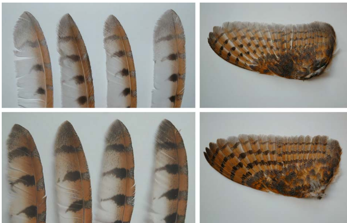
Figure 3. Tips of primaries P8 of four males (top left) and four females (bottom left). Because the bar pattern is repeated in subsequent feathers, complete wings of males (top right) are less heavily barred compared to those of females (bottom right).