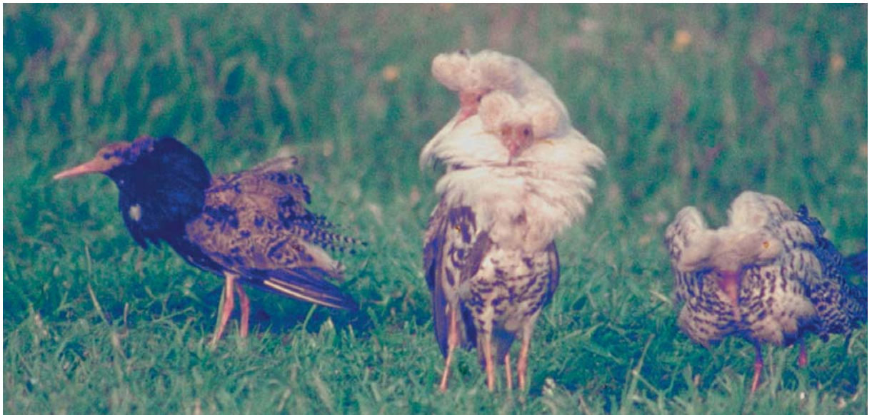
Figure 1. Two territorial independent males (left and right) and two satellite males (middle) on a lek.

Warburg 1966, van Rhijn 1991, 2013, Jukema & Piersma 2006): independent males, satellite males and faeders (female mimics). These male types and strategies become apparent on leks where males display and females select a mating partner. It has been shown that each male follows only one of these strategies during its whole life and that the different reproductive strategies in Ruffs are based on different combinations of genes (Lank et al. 1995, 2013, Farrell et al. 2013). Independent males try to defend a territory on the lek and have mostly dark coloured nuptial plumage. Satellite males do not establish their own territory but instead, to gain access to females, temporarily associate with one of the independent males. Satellites have mostly white nuptial plumage (Figure 1). However, plumage coloration sometimes fails to predict reproductive strategy, as some types of plumages may occur both among independent and satellite males (Hogan-Warburg 1966, van Rhijn 1991). Faeders do not develop conspicuous ornamentation and look like females.