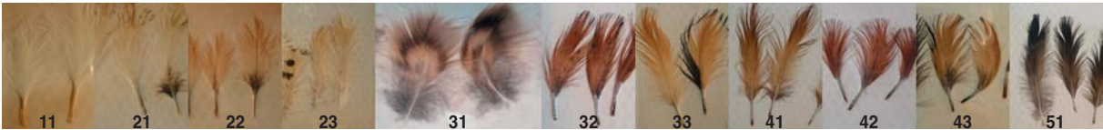
Figure 4. Samples of the colours of the feathers. The fifth panel (31) represents a sample of the second generation (alternate) plumage, as this colour is rare in nuptial plumages. All other samples are from third generation plumages.