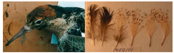
Figure 7. Head and feather sample of male 149101, apparently with two different hues in its nuptial plumage.

For birds in complete nuptial plumage, we rarely scored more than one distinct hue (ruff and head tufts together, see Table 3). In the central part of the table, within the inner rectangle, the values in cells are zero or very low,