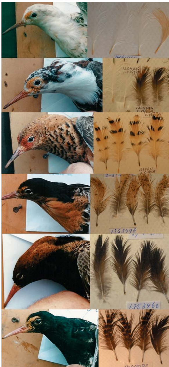
Figure 6. Portraits and feather samples of six males, typical representatives of the general plumage categories: 1461959 (white–white), 1337634 (white–hue), 1337636 (hue–hue), 1353498 (hue–black), 1353460 (black–hue) and 1409083 (black–black).