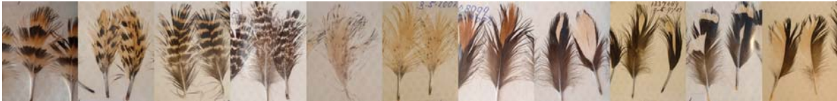
Figure 5. Samples of different patterns of feathers. From left to right: wide bars, broken bars, two variants of fine bars, black threads, black spots, four different variants of fairly large patches at the tip, and black and hue separated by the shaft.