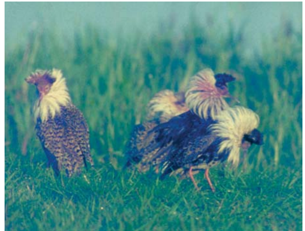
Figure 8. Reproductive strategy is not fully associated with white plumages. The two males at the right side are both independent males. Their ruffs are (almost) white and their head tufts black. The male at the left side of the picture is a satellite male with a white ruff and light brown head tufts. The male on the background is probably a satellite male.

The fourth, patterning of feathers, has been simulated with reaction-diffusion models (Prum & Williamson 2002). These simulations suggest that the number of (molecular) instructions is not necessarily high for creating a complicated colour pattern in a