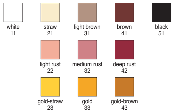
Figure 2. Colour classification for nuptial feathers. Scheme and drawings developed by D.B. Lank and C.M. Smith.

Most analyses were performed by JvR. The first analysis, on all 1814 individuals caught at stopover sites ( Primary Dataset ), generated questions on both general and more detailed characteristics that had not yet been scored. To work this out, photos and feather samples of a subset of 781 males (the best accessible records) were carefully viewed, interpretations in the