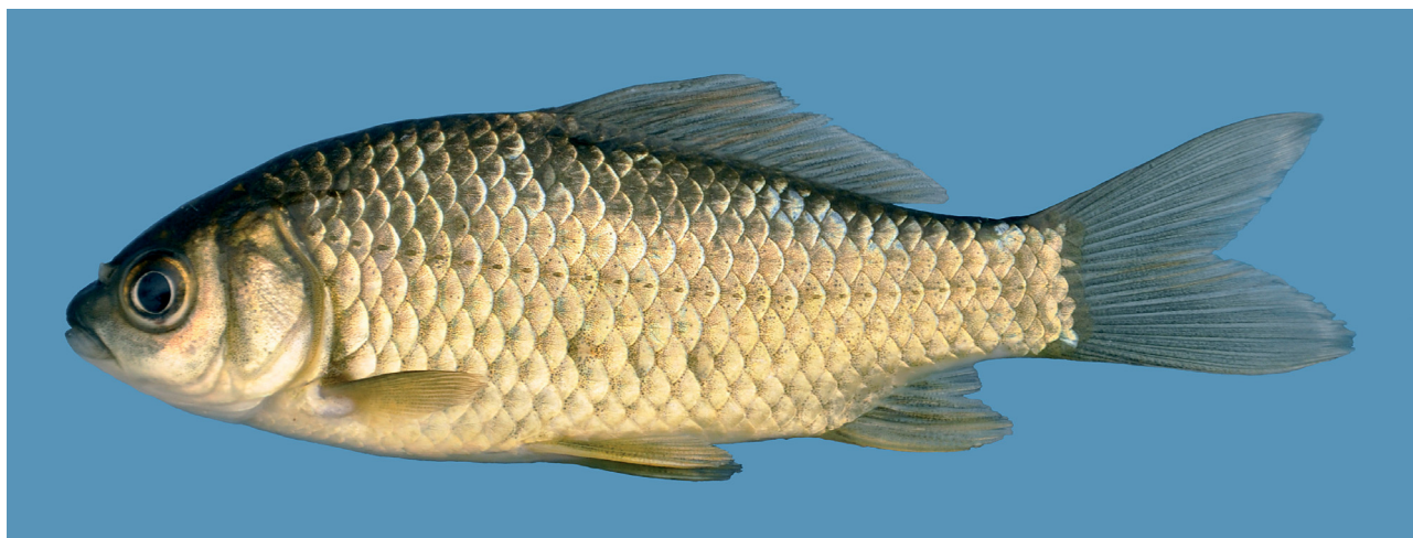
Fig. 5. Carassius auratus , CMK 25714, 68.4 mm SL; Laos: Houaphan Province: Nam Ma drainage.

The material of the new species was obtained during a survey conducted in connection with an Environmental Impact Assessment of the Nam Ngum 3 hydropower project. It is a pleasure to thank François Obein for