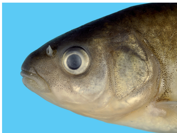
Fig. 2. Carassius praecipuus CMK 22746, paratype, 62.0 mm SL; head (reversed). ►

straight line to dorsal-fin base, then more or less straight to caudal-fin base. Caudal peduncle 1.3-1.4 times longer than deep. Interorbital area convex. Head longer than deep, dorsal profile straight; ventral profile arched from mouth to pelvic-fin base, then straight to anal-fin origin; snout blunt. Mouth terminal to subterminal, anteriormost point of cleft below level of lower margin of eye, upper lip slightly projecting beyond tip of lower jaw. Lower jaw-quadrates junction about at vertical of anterior margin of eye. 10+10 (1), 10+11 (4*) or 11+10 (1) = 20-21 gill rakers on first gill arch, their length about 1-1.5 times width of arch and about 3-4 times in length of gill filaments at same position.