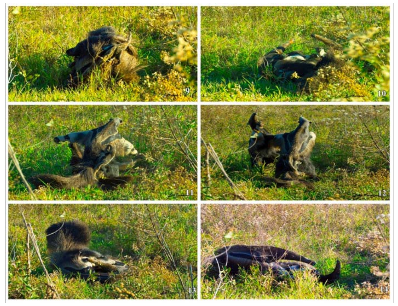
FIGURES 9–14. Sequence of the courtship and mating behavior of wild giant anteaters ( Myrmecophaga tridactyla) in Santa Rita do Araguaia, Goiás State, Brazil.