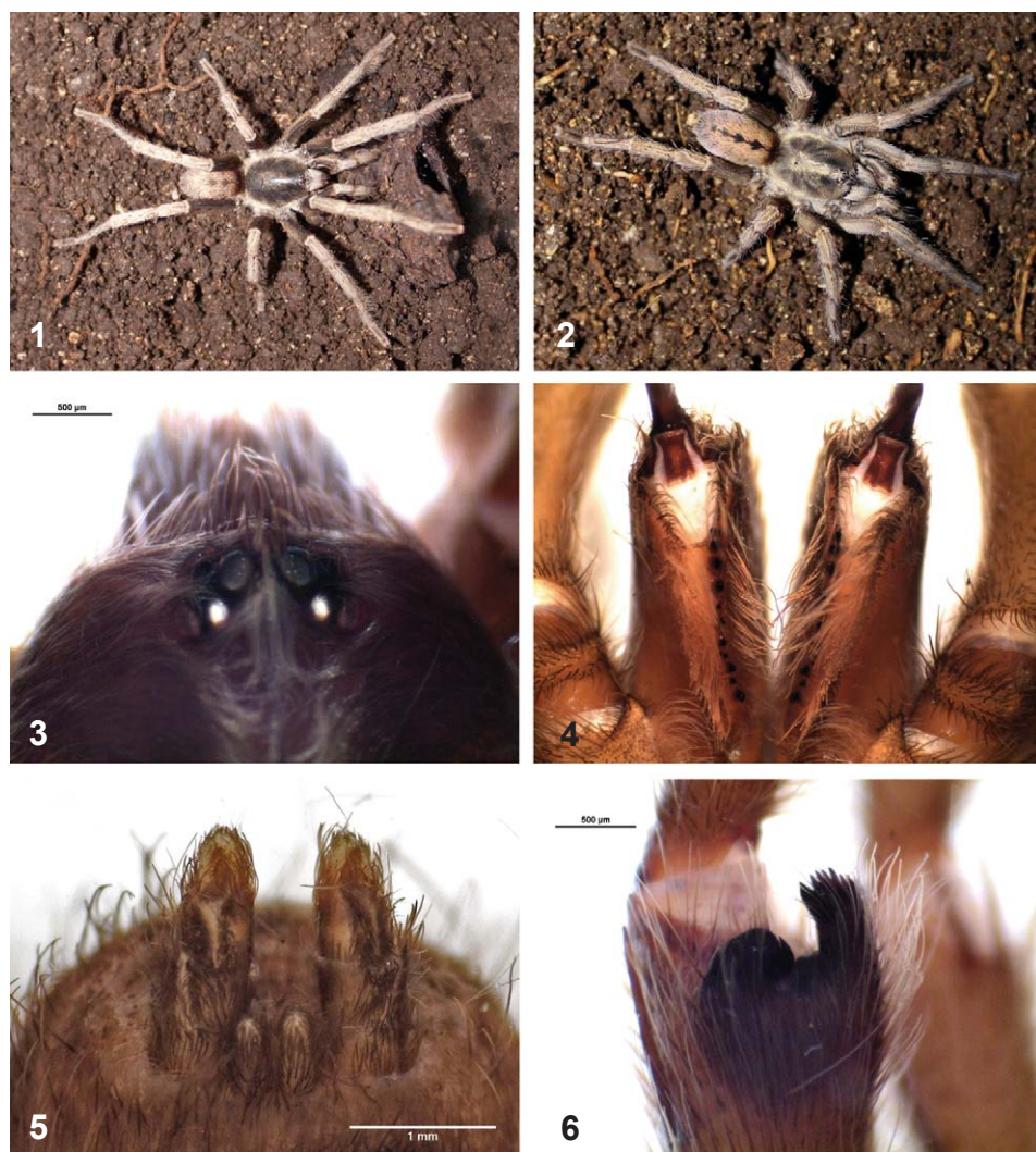
Figs 1–6. Nesiergus insulanus : (1) male with abdominal markings and femora darker than other leg segments and palpi clearly visible; (2) female with abdominal markings clearly visible; (3) dorsal view of eye pattern, displaying procurved anterior row and recurved posterior row; (4) ventral view of chelicerae, indicating position of fangs and size and arrangement of cheliceral teeth on promargin; (5) male spinnerets, showing PLS with differing segment lengths and diagnostic triangular apical segments; (6) tibial apophysis.

to labium, serrulae present on anterior lobe. Labium slightly longer than wide, length 1.26, width 1.12, with ca 47 cuspules limited to the centre. Chelicerae with 12 teeth of differing sizes on promargin (Fig. 4).