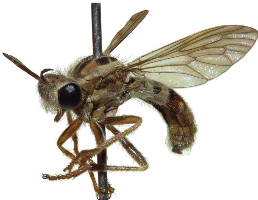
Fig. 1. Hermannomyia engeli (Hull, 1962), entire male.

The material listed for H. engeli and H. oldroydi (alphabetically according to country and in order of latitude) relates both to specimens previously recorded in the literature (as indicated at the end of those records) and specimens recorded for the first time.