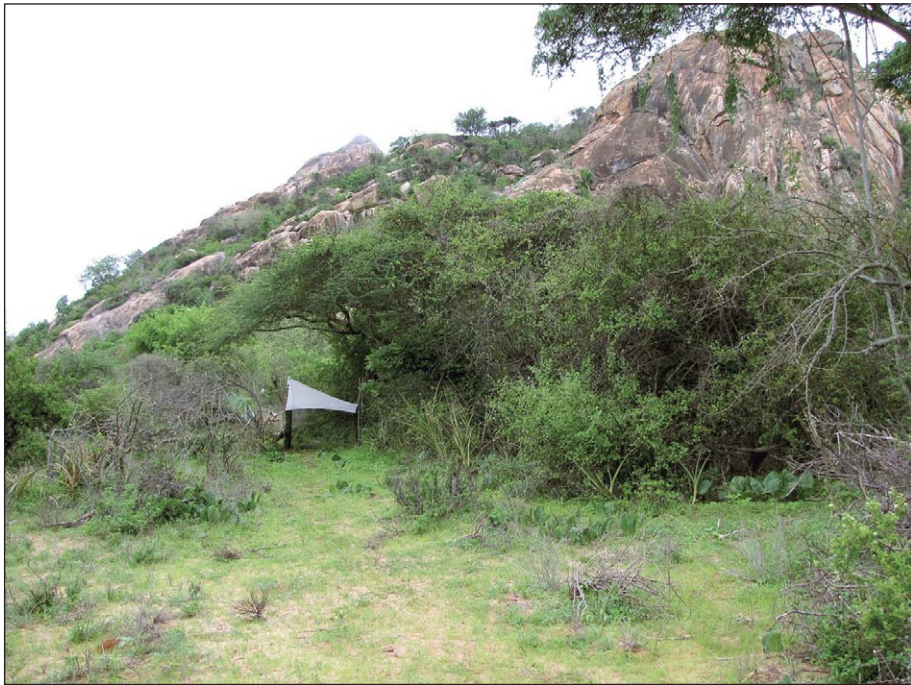
Fig. 11. The Malaise trap set at the foot of Ukasi Hill, where the type series of Hermannomyia ukasi sp. n. was collected.

Holotype: ♂ 'KENYA, Eastern Prov. / base of Ukasi Hill / 613 m. 0.82103°S. / 38.54443°E [0°49'S 38°33'E]', 'Malaise trap. Acacia / Commiphora savanna / 21 NOV-5 DEC 2011 / R. Copeland' (NMKE).