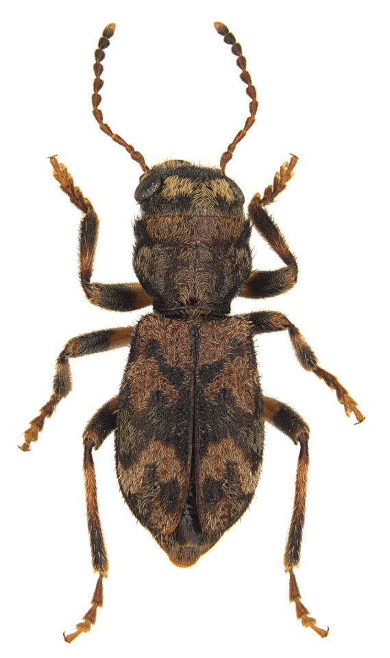
Fig. 1. Nonalatus epigaeus sp. n., habitus.

Head : Red-brown to dark brown, glossy; with dense, fine, regular punctation. Labrum brown, bilobed; anterior part of clypeus yellow, glossy; mouth parts more or less yellow-brown to light yellow, except the black mandibles; terminal labial palpomeres securiform, terminal maxillary palpomeres with sides parallel, constricted apically. Gula long, light red-brown, glossy, gular sutures apically slightly divergent, gular process of medium size. Head including eyes more or less as broad as anterior width of pronotum, vested with black and white setae, behind middle with a broadly Y-shaped pattern of white, depressed setae. Eyes small, coarsely facetted, margined, conspicuously emarginate at antennal insertion, with a brush of yellow setae; interocular space (frons) almost three eye widths. Antennae with 11 antennomeres, long, stout, reaching base of pronotum when laid back, brown, from A8 onwards becoming darker, A11 only basally narrowly dark, remainder light brown; A1 very long, slightly bent; A2 short, cylindrical; A3 twice as long as A2; A4 slightly shorter than A3, slightly dilated distally; from A5 onwards dilated distally, becoming thicker and more compact; A4–A10 progressively becoming slightly