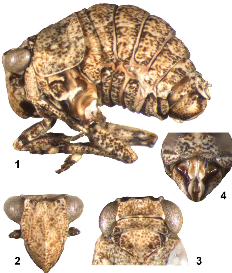
Figs 1–4. Campures pallens gen. et sp. n., holotype: (1) lateral view; (2) frontal view; (3) head and pro- and mesonotum, dorsal view; (4) ovipositor and VII sternum, ventral view. Total length of the specimen: 3.2 mm.

Coloration: General coloration light-brown yellowish with dark-brown spots and dots (Figs 1–4). Genae with dark-brown spot above the scapus. Pedicel dark brown with light-yellow sensory organs. Postclypeus with large oval dark-brown spot on each side. Apex