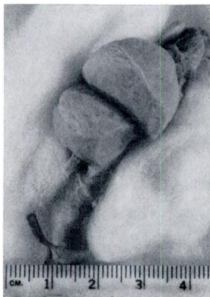
FIGURE 1. Testicular tumor from largemouth bass showing fibrous, swollen cut surface.

The cell morphology, banding and growth patterns, and staining characteristics of the lesion indicate a leiomyoma