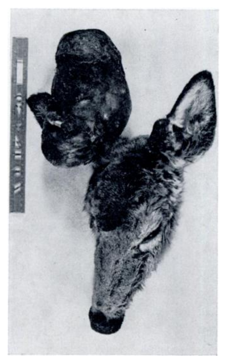
FIGURF. 1. Partially ossified fibromas of a white-tailed doe. Note ear tags being enveloped by the fibromas.

The 51/2 year old doe was emaciated (43.6kg) with depleted subcutaneous, pericardial and perirenal fat reserves. The mean kidney fat index10 was 13.5%, and the femur marrow was red and gelatinous, containing 36% fat.12 The rumen contained 84% deciduous leaves and woody twigs. The remaining 16% was rose hips and grass. Two Taenia hydatigena cysticerci were found in the abdominal mesenteries. The doe had been bred in the 2nd week of November, as determined from crown-rump measurements of a male and a female fetus recovered from the uterus.1,4 No gross abnormalities or lesions were noted in the fetuses or in any of the internal organs of the doe. A darkly pigmented growth on the right ear measured 25 cm x 15 cm and weighed 2.3 kg (Fig. 1). It