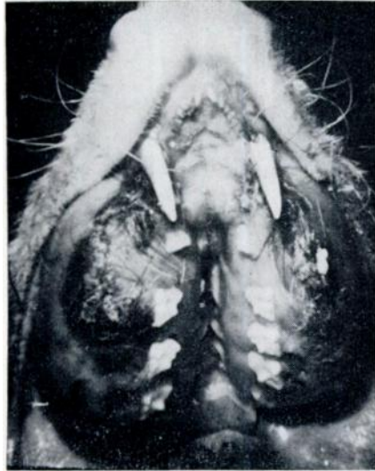
FIGURE 1. Opossum with fibrous osteodystrophy. Bilateral swelling of maxillae with ulceration of gums and displacement of the teeth.

Representative tissues were fixed in 10% neutral buffered formalin, embedded in paraffin, sectioned at 5-6 \mu m, and stained with hematoxylin and eosin. Histologically, there was extensive proliferation of fibrous tissue in the marrow spaces of the maxilla and mandible. Cortical bone was greatly thinned or absent in some areas. Small trabeculae of osteoid were scattered throughout the mass (Fig. 2). Nonmineralized osteoid seams were present on the surface of many trabeculae. Numerous osteoclasts were within notches of remaining bone spicules.