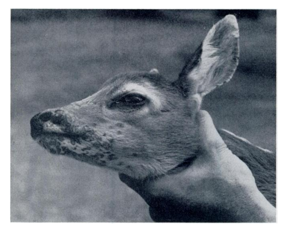
FIGURE 1. White-tailed deer buck fawn with papules of dermatophilosis on the muzzle and ear margin.

In Giemsa-stained 10 \mu m frozen sections from skin lesions, long, parallel chains and individual coccoid cells characteristic of D. congolensis were evident primarily in the stratum corneum, with foci of these organisms frequently associated with hair follicles (Fig. 2). Hyperskeratosis, delamination and erosion of the stratum corneum resulted from local proliferations of these bacteria. The cel-