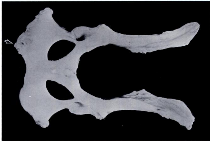
FIGURE 3. Bony projection at medial angle of the right ischiatic tuberosity.

The survival of #5157 to his age and condition at death is remarkable because wolves were heavily exploited by humans in that part of Minnesota until 1974. Longevity of this wolf implies considerable experience at hunting and killing deer and avoiding humans. That experience probably could partially compensate for the loss in mobility that must have accompanied his osteoarthrotic condition.