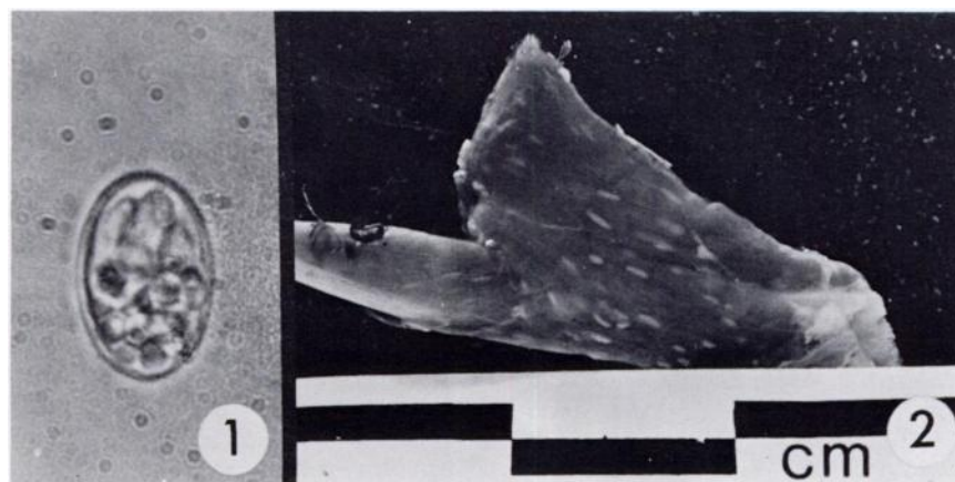
FIGURE 1. Single sporocyst passed by striped skunk fed muscle from a shoveler infected with Sarcocystis sp. The granular sporocyst residuum is concentrated at one pole; Portions of two of the four sporozoites are visible. Wet mount \times 1950 .