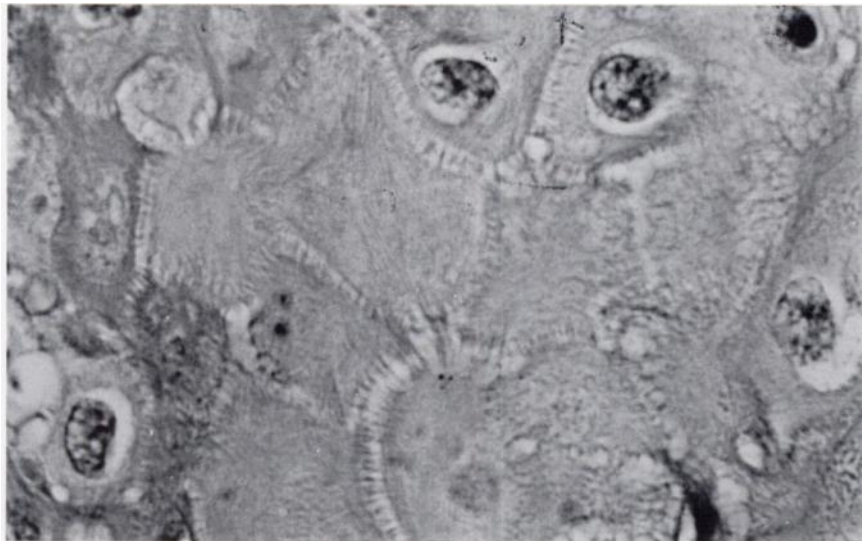
FIGURE 3. Clearly defined intercellular bridges among the neoplastic squamous cells. PTAH 1,100 \times .

seen in most parts of the tumor. The borders of the neoplastic mass at the interface with normal dermis indicated that the tumor was growing by expansion rather than infiltration. Local lymphatic and blood vessels were free of tumor permeation or metastatic invasion.