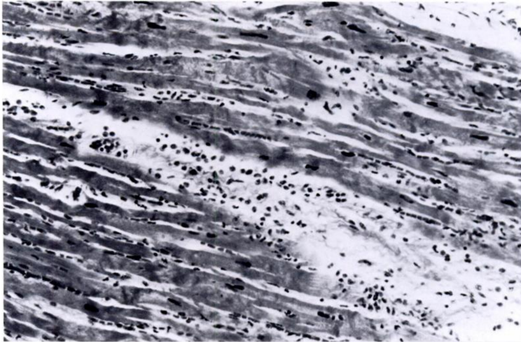
FIGURE 1. Photomicrograph of the myocardium of an elephant with diffuse acute myocarditis. There is edema of the interstitium and a mixed infiltration of polymorphonuclear leucocytes, lymphocytes and histiocytes. H&E, \times 200 .

al., 1977, J. Am. Vet. Med. Assoc. 171: 902–904). That incident also involved African elephants, but the lesions described were more of a nonsuppurative myocar-