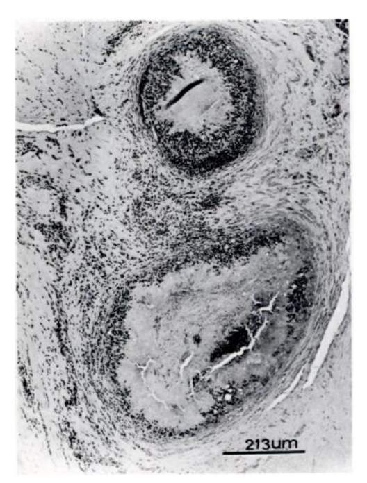
FIGURE 3. Circumscribed foci of granulomatous inflammation within gizzard musculature of a mallard. H&E.