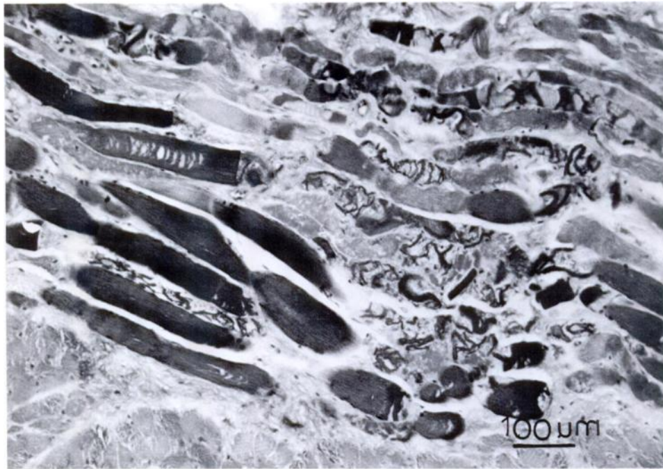
FIGURE 3. Skeletal muscle of a tapir with nutritional myopathy. Note myofibers with vacuolation, disintegration, loss of cross-striation, contraction bands and hyalinization. H&E.

liver of this tapir, in conjunction with the degenerative myopathy of skeletal and tongue muscle and possible myoglobinuric nephrosis, were consistent with nutritional myopathy due to vitamin E deficiency. Schistosomiasis and myopathy due to hypovitaminosis E are recognized as significant problems in both domestic and wild animals. Our findings suggest that the tapir should be considered among these species.