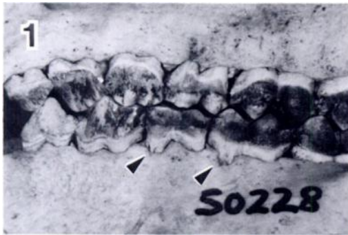
FIGURE 1. Grade 2 lesions of periodontal disease affecting the first and second lower molars of a 22- to 26-mo-old bushpig from the Vumba, Zimbabwe.