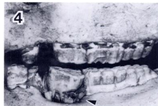
FIGURE 4. Grade 3 lesions and the accumulation of fibre at the second lower molar of an 18- to 25-mo-old warthog from Nagupande, Zimbabwe. The upper first molar has been lost and part of the crown of the lower first molar is missing without apparent periodontal disease.

All the lesions involved cheek teeth and lesions were not observed around the incisors or canines. The molars were affected significantly more frequently than the premolars in the bushpig ( P < 0.01 ) but the fourth premolar was often affected in warthogs (Table 2). Plant fibres and debris were often packed into the cavities formed by erosion around the roots of teeth (Figs. 3, 4).