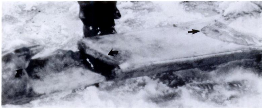
FIGURE 1. Proximal (to the right) and distal (to the left) fragments of fractured right mandible of a female bowhead whale, shown after all overlying tissue had been removed. Curved arrows indicate fracture site, which has been separated by approximately 0.5 m. Straight arrow on proximal fragment indicates demarcation between devitalized tissue (to the left) and apparently healthy tissue (to the right). Note the absence of a callus.

and 25 cm wide in the center, was fractured approximately midlength. The broken ends were not overriding. The bone was gray, apparently necrotic and free of periosteum for approximately 1 m cranial and caudal to the fracture site (Fig. 1). The 1 to 3 cm tissue layer immediately overlying this 2 m of bone was necrotic and stripped easily from the bone. There were two foramina clearly visible on the medial aspect of the proximal mandibular fragment (Fig. 2). One was approximately 0.5 m caudal to the fracture, the second