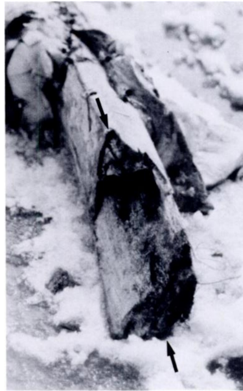
FIGURE 3. Distal fragment of the fractured right mandible of a female bowhead whale. Arrows indicate fracture site. Note the absence of a callus.

mandibular fractures. None has been documented in the literature, and this fracture is the first of any type that we have seen in over 100 harvested bowhead whales.