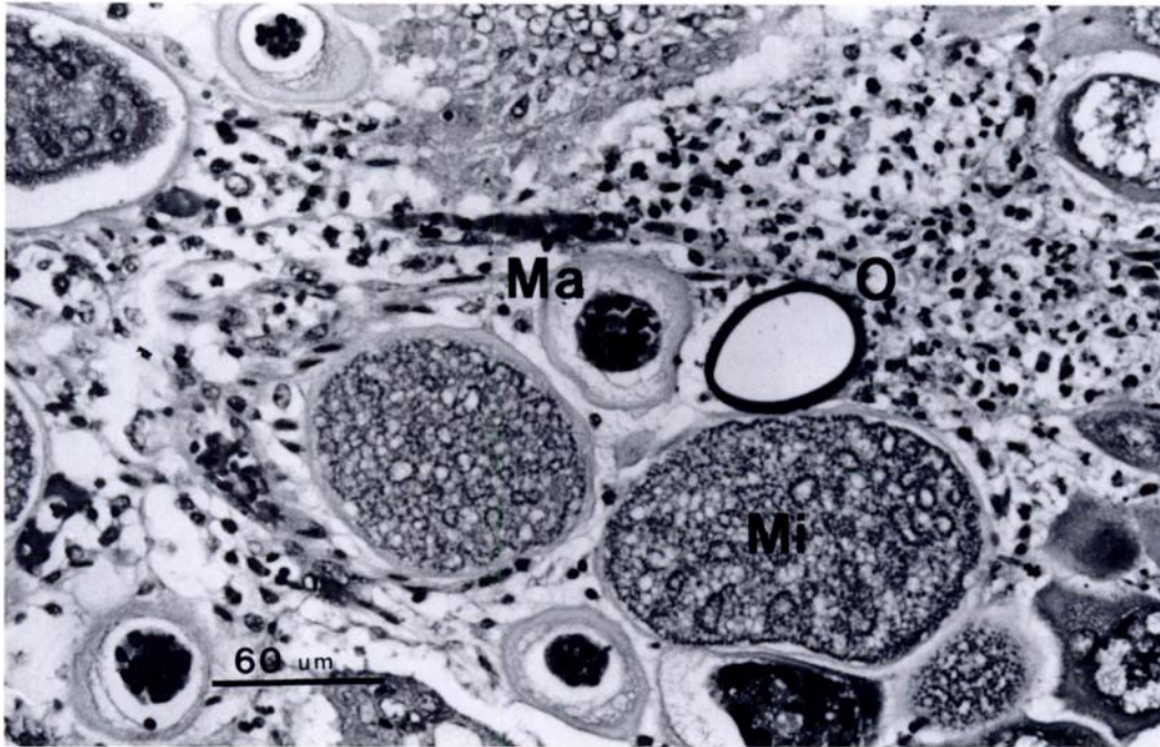
FIGURE 2. H&E. 2. Microgametocytes (Mi), macrogametes (Ma) and oocyst (O) of Eimeria arundeli from a common wombat. The contents of the oocyst are missing (artefact). Fibrinopurulent exudate in the lamina propria of the mucosa above the oocyst. H&E.

In case one, scattered gametocytes were detected in the lamina propria of the colon, a location where they have not been observed previously. Schizonts are unknown in this species (Barker et al., 1979) and a search for them in the gastrointestinal tract, liver and biliary epithelium of this animal was unrewarding. Sections of the lung were congested, and occasionally alveoli contained some proteinaceous fluid, and a few neutrophils. In both cases, lesions were not present in other tissues. Lymphoid involution in splenic white pulp was not marked.