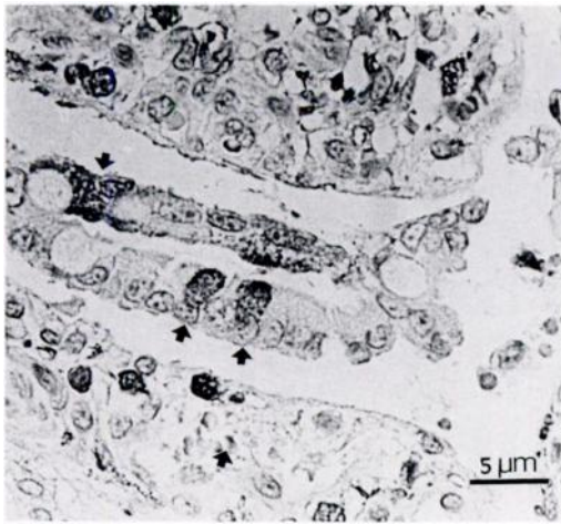
FIGURE 3. Canine distemper viral antigen in infected cells of the small intestine (arrows) of a fox. Anti-canine distemper virus-indirect avidin-biotin peroxidase complex.

1930; Dedié et al., 1957; cited by Appel and Gillespie, 1972). There are several reports of the infection in gray foxes ( Urocyon cinereoargenteus ) in North America (Hoff et al., 1974).