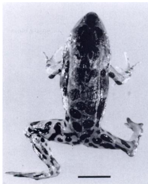
FIGURE 2. Recently metamorphosed Rana pipiens with ectromelia, ectrodactyly, and a knee anteversion of the right hindlimb. Bar = 1 cm.

Ectromelic individuals were characterized by the absence of one or more parts of the limb (Figs. 1 and 2). The tarsal bones, tibiofibula, and femur were sometimes partially or completely missing. The affected leg was usually marked by muscular atrophy and occasionally by bony excrescences. Ectrodactyly (Figs. 1 and 2) was represented by the lack of one or more toes or parts of toes (phalanges, metatarsal bones). Missing digits varied from one to five on the affected foot. Both conditions were polymorphic and occurred on the right or the left side of the body. Bilateral deformities without symmetrical pattern were also observed among some anurans. In general, the proximal part of the remaining leg was clinically functional. On microscopic examination, the affected limbs had epiphyseal hypoplasia and segmental hypoplasia of the diaphysis of the femur and tibiofibula bones. Partial or complete agenesis of the tarsus, metatarsal bones and phalanges was also usually present. Epiphyseal cartilage proliferation was observed in one individual affected by a knee anteversion (Fig. 2). Inflammatory changes, parasites, and neoplastic altera-