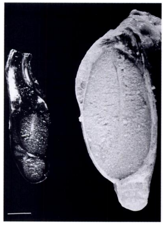
FIGURE 1. Testis of deer with testicular hypoplasia compared with a testis of a normal deer of similar age. Bar = 1 cm.