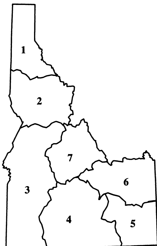
FIGURE 1. The state of Idaho (USA) divided into seven hunting regions.

blood tube (Vacutainer, Becton Dickinson, Rutherford, New Jersey, USA), and a data sheet. Information recorded included species sampled, gender, estimated age of animal (based on dentition), hunting unit, date of kill and date of sample collection. As hunters presented their harvested game at hunting check stations throughout the state, officers collected vitreous samples as per the technique described by Lincoln and Lane (1985). In the 1994 sampling, officers also obtained approximately 5 cm 3 sections of liver, if available, for quantifying of selenium (Se) concentrations.