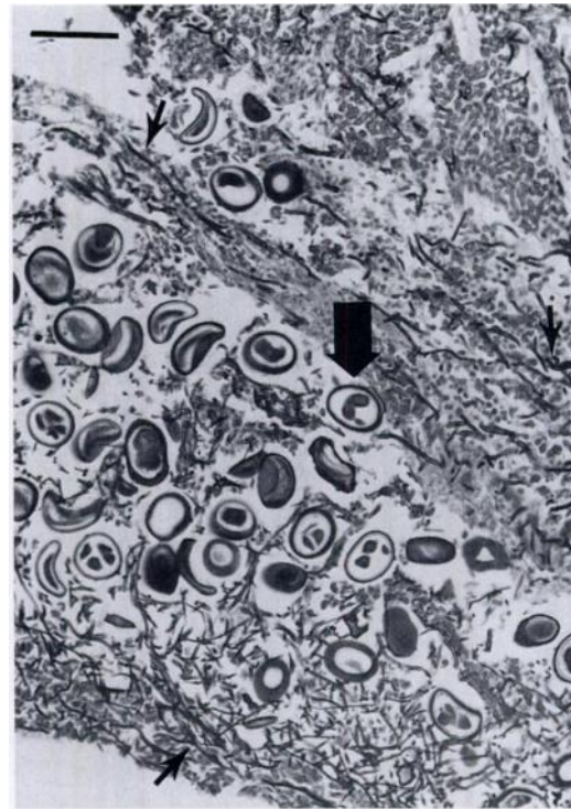
FIGURE 2. Larvated Diplotrriaena tricuspidis eggs (large arrow) mixed with abundant Aspergillus fumigatus hyphae (small arrows) in the lung of a blue jay. Grocott's methenamine silver stain. Bar = 100 \mu m.

(Difco, Chicago, Illinois, USA) and incubated at 25 C. Fungal colonies were identified visually (Rippon, 1988). Nematodes were collected and placed in 5% neutral buffered formalin for later identification. Sections of brain, kidney, skeletal muscle, liver, proventriculus, ventriculus, heart, testis, lung, and air sac were fixed in 10% neutral buffered formalin, embedded in paraffin, sectioned at 3 \mu m thickness, and stained with hematoxylin and eosin. Additional sections of lung and air sac were stained with Grocott's methenamine silver (GMS) stain (Luna, 1968).