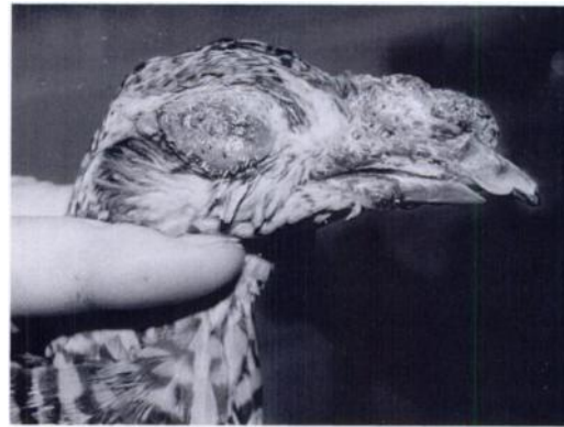
FIGURE 1. Multiple firm to fluctuant lesions due to reticuloendotheliosis on the head of a female wild-caught greater prairie chicken ( Tympanuchus cupido pinnatus ).

Frozen serum and plasma from 25 APC and 45 bobwhite quail ( Colinus virginianus ) collected between 1987 to 1993 from the APC National Wildlife Refuge (Eagle Lake, Texas, USA) were tested by virus isolation and virus neutralization to determine the prevalence of infection and antibodies in wild birds. In March 1995, two wild adult male APC captured on the refuge were bled and tested as described above.