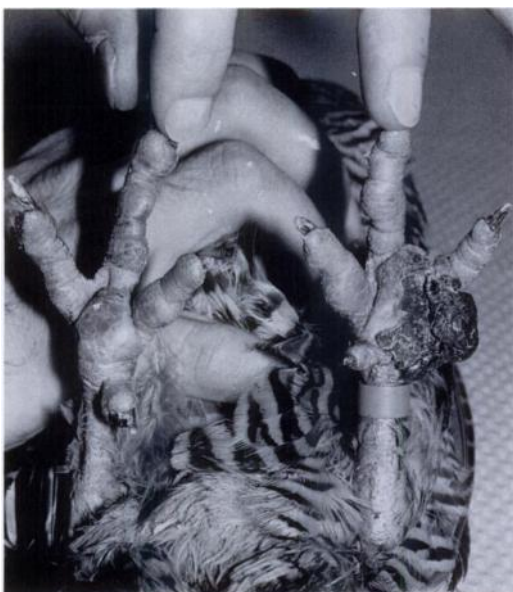
FIGURE 2. Multiple firm to fluctuant lesions of reticuloendotheliosis on the legs and feet of a female wild-caught greater prairie chicken ( Tympanuchus cupido pinnatus ).

plump, cytoplasm-replete, histocyte-like cells (Fig. 3) to elongated, slightly fusiform cells (Fig. 4) was suggestive of lesions of RE infection observed in other species (Li et al., 1983; Witter, 1991). Reticuloendotheliosis virus was isolated and viral antigen was identified by PCR and ELISA in tumors from both birds. Neither of these two birds was tested for REV before euthanasia.