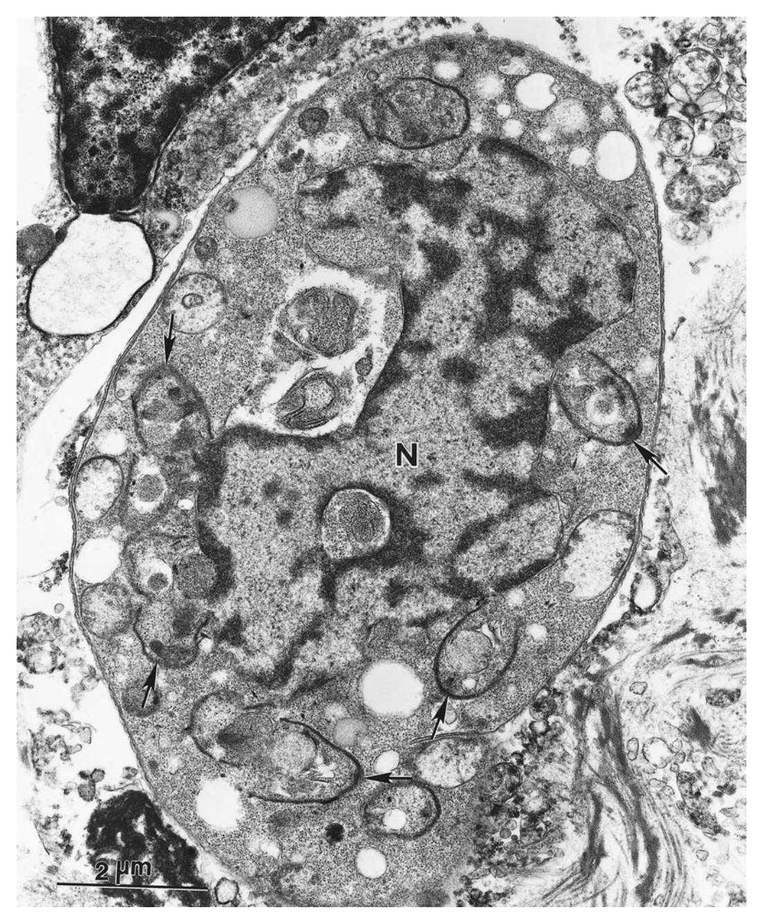
FIGURE 2. Transmission electron micrograph of an immature schizont of Sarcocystis sp. from a wild turkey with multilobed nucleus (N) and merozoite analagen (arrows).

Mississippi, Missouri, North Carolina, Puerto Rico, South Carolina, Tennessee, Virginia, and West Virginia. Funds were provided by the Federal Aid to Wildlife Restoration Act (50 Stat. 917) and through Grant Agreement 1445-GT09-96-0002,