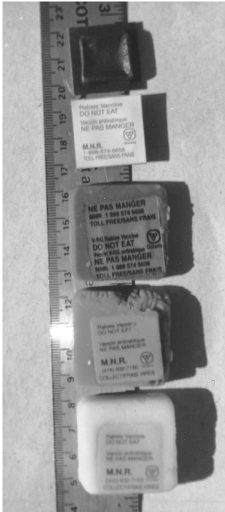
FIGURE 1. Photograph (from top to bottom) of a Sugar Vanilla bait (SV), a cheese bait (CH), a small Sugar Vanilla bait (Sml SV), an SV and a sml SV bait (showing the difference in thickness of baits) and flocked blister packs that contain liquid vaccine.

coons in urban habitats are very sedentary (raccoon movements would not bias the results). One to 3 wk post baiting, raccoons were live-captured (Tomahawk model 106 and 108; Tomahawk Live-Trap Co., Tomahawk, Wisconsin, USA), immobilized (20–30 mg ketamine hydrochloride), ear-tagged for identification, vaccinated against rabies with a 1 ml intramuscular injection of Imrab inactivated rabies vaccine (Rhone-Merieux, Athens, Georgia, USA), a first premolar tooth collected, and