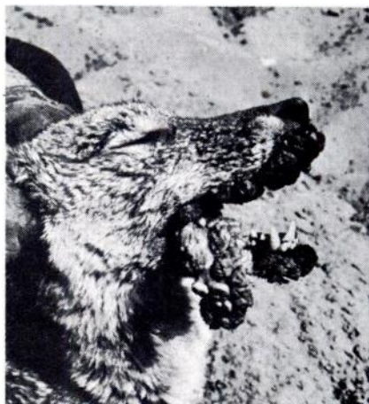
FIGURE 1. Gross lesions of coyote oral papillomatosis illustrating involvement of the tongue and oral mucosa.

Histopathologically, this tumor was epithelial and resembled the canine oral papilloma (Smith and Jones, Veterinary Pathology, Lea and Febiger. 422, 1966). The bulk of the papilloma was made up of thick papilliform growths of stratified squamous epithelium covering and supported by thin, delicate filiform branches of connective tissue from the dermis, containing blood vessels and leukocytes (Fig. 3). The epithelial overgrowth was covered by a heavy layer of cornified epithelium (Fig. 3), a classical feature of canine papillomatosis. Many of the squamous cells below the cornified layer