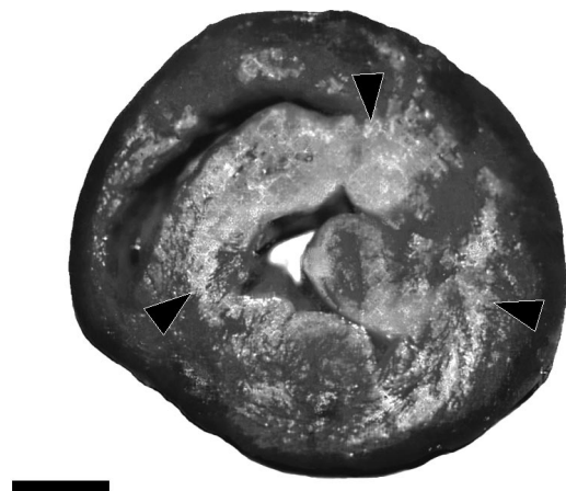
FIGURE 1. Heart, fallow deer. Multiple coalescing pale areas in the myocardium (arrowheads). Note the thickened left ventricle. Bar=1 cm.

matoxylin (PTAH). Additionally, immunohistochemistry was performed with the use of anti-desmin and anti-vimentin mouse antibodies (DAKO, Glostrup, Denmark), according to the manufacturer's protocols.