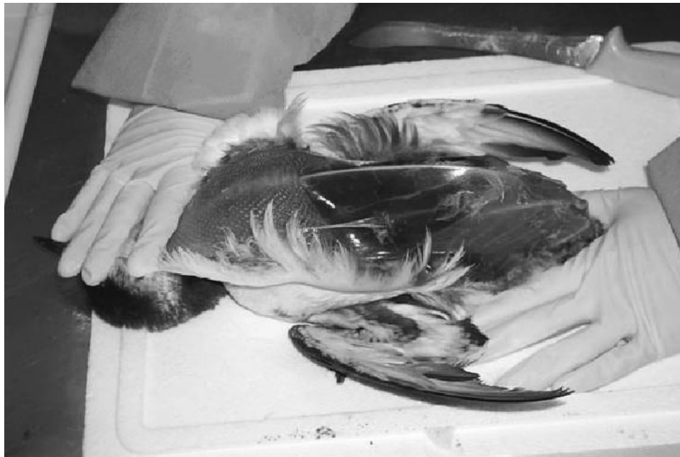
FIGURE 1. Cachetic common murre with severe atrophy of the pectoral muscles and absence of subcutaneous fat.

Microscopically, hepatocytes and Kupfer cells contained brown pigment consistent with hemosiderin, as demonstrated by Perl's Prussian blue stain (Fig. 2). Deposits