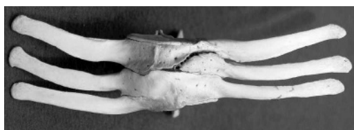
FIGURE 3. Ventral view of fused 11th, 12th, and 13th lumbar vertebrae of striped dolphin ( Stenella coeruleoalba ) from the Adriatic Sea. Old pathologic changes (osteolysis, fusion of vertebral bodies and deviation of vertebral canal) that might be because of previous localized osteomyelitis caused by C. tertium strain Zagreb are clearly visible. Bar=5 cm.

conditions. A Gram's-stained smear of granules from specimens both revealed large gram-positive rods with large, oval, terminally placed spores. After 24 hr incubation under aerobic and anaerobic conditions, a pure culture of opaque, medium-size colonies were recovered. Although cultures of C. tertium often present as gram-negative, especially when cultured under aerobic conditions (Lew et al., 1990), both the aerobic and anaerobic cultures from this striped dolphin were clearly identified as gram-positive non-sporulating rods. Identification of colonies was carried out according to procedure described by Quinn et al. (1994), and using API20 A (bio-Mérieux, Marcy-l'Etoile, France), the isolate was identified as C. tertium with a probability of 99.9%.