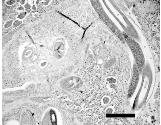
FIGURE 3. Bronchiole blocked by adult lungworm, inflammatory cells, and hypertrophic bronchial epithelium. Bar=200 \mu m.

The tissue changes caused by the lungworms were also microscopically demarcated. Eggs and stage 1 larvae (L1) were visible in alveoli, as well as adult worms in bronchioles (Fig. 2). In some cases, the entire affected tissue was full of different developmental stages. The bronchioles were often blocked by worms, inflamma-