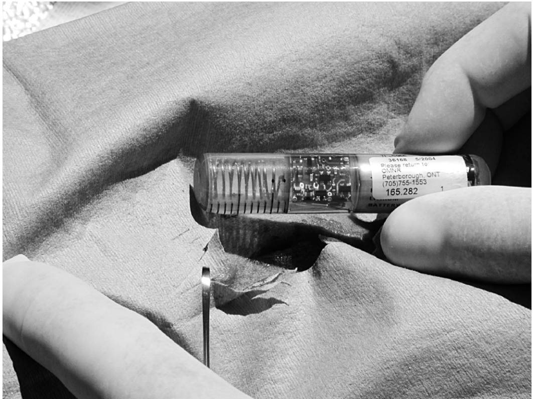
FIGURE 1. A detailed view of an intraperitoneal VHF radio transmitter (7.9-cm length \times 1.7-cm diameter; ATS, Isanti, Minnesota, USA) prior to insertion into the peritoneal cavity of a 5-wk-old wolf pup in Algonquin Provincial Park. The implant consisted of a lithium battery (right), circuit board (middle), and a coiled antenna (left) packaged in a biologically inert resin.

Animal Health, Guelph, Ontario, Canada) (0.1 mg/kg) for sedation and intra-operative analgesia. Anesthesia was then induced with 8% sevoflurane (Sevoflurane, Abbott Laboratories, St. Laurent, Quebec, Canada) in oxygen with a flow rate of 2–3 l/min via a tight-fitting anesthetic face mask. The anesthetic apparatus consisted of a precision sevoflurane vaporizer (Penlon Sigma Delta, Penlon Ltd., Abingdon, Oxon, UK), a D- or E-size aluminum oxygen cylinder, a dial-up combination regulator/flowmeter (Model 3108-L, Inovo Inc., Naples, Florida, USA), a Bain's anesthetic circuit, and a 2-m hose for waste gas. Total weight of the apparatus including the aluminum oxygen cylinder was 11.4 kg with the E-size cylinder, and just 9.7 kg with the smaller D-size cylinder.