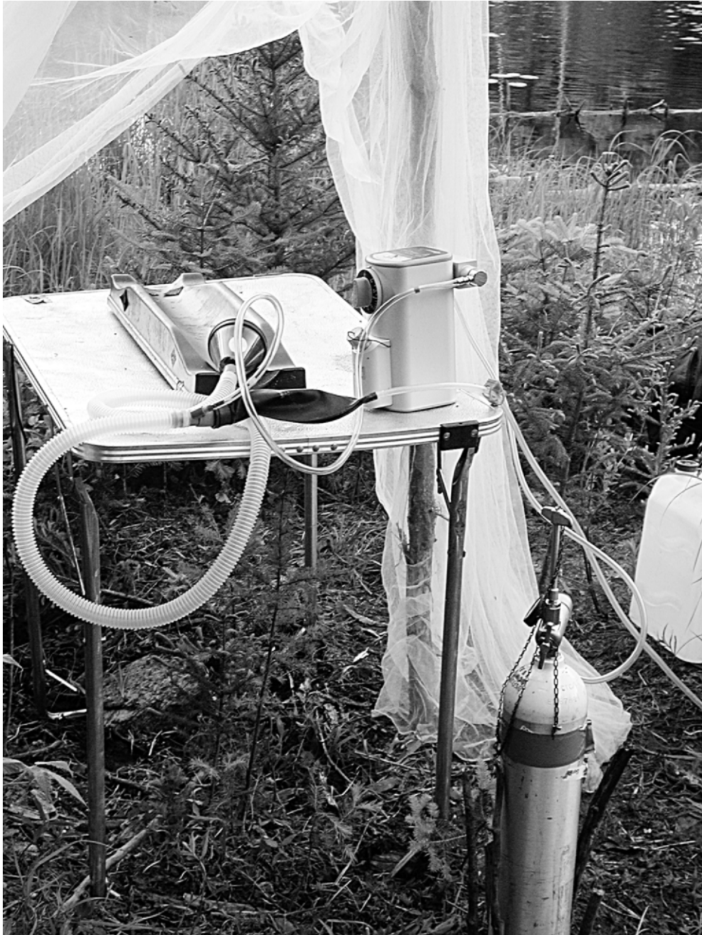
FIGURE 2. Surgical setup for field implantation of intraperitoneal VHF transmitters into wolf pups using sevoflurane. The setup included an oxygen cylinder with a dial-up combination regulator/flowmeter, a sevoflurane vaporizer placed on the table with a Bain's anesthetic circuit, the respective hosing, and a tight-fitting anesthetic face mask.

adhesive (VetBond, 3M, London, Ontario, Canada) to the skin wound.