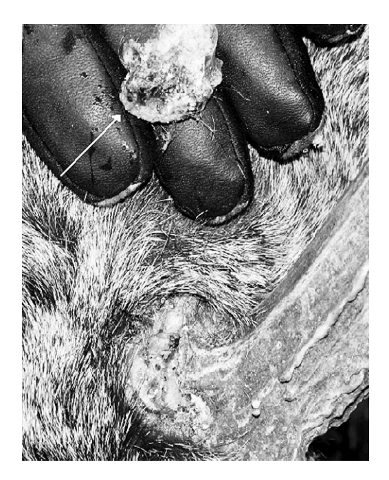
FIGURE 2. Exudate on the antler pedicle of 4.5-yr-old male white-tailed deer at Chesapeake Farms, Maryland, USA, 2006. Note the skull fragment that split away from the antler pedicle.

Maryland, USA, deer were positive for A. pyogenes. Other bacteria identified included Staphylococcus (n=6), Bacillus (n=4), Klebsiella (n=1), and Pseudomonas (n=1; Davidson et al., 1990; Baumann etal., 2001). Eighty percent (n=4) of the A. pyogenes results came from the nasopharyngeal samples. None of the Texas, USA, deer cultured positive for A. pyogenes. Other bacteria identified from Texas, USA, samples included Staphylococcus (n=8) and Bacillus (n=9). The failure to culture A. pyogenes from nasopharyngeal or antler base swabs suggests that presence of this organism associated with intracranial abscessation may be limited at our Texas, USA, site. It is possible the arid climate may discourage growth of A. pyogenes; however, our study design does not specifically address this question.