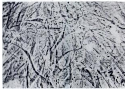
FIGURE 2. Cells from mesentery of dolphin — 1 month in culture.