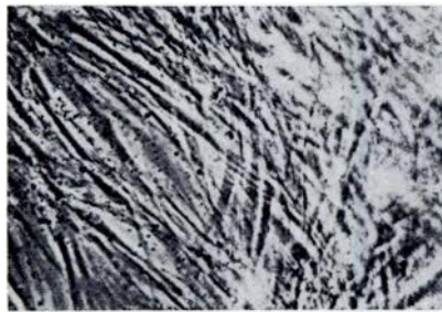
FIGURE 1. Cells from lung of gray seal — 3 weeks in culture.

is a virus, and to ascertain if the karyotype and viral susceptibility of the altered cells has been changed.