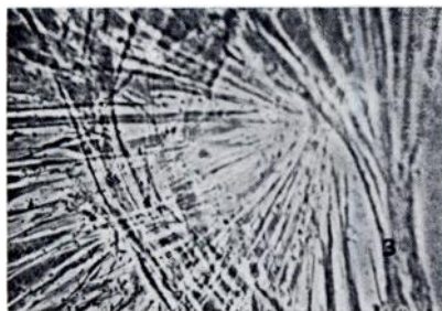
FIGURE 3. Cells from lung of gray seal — 2 months in culture.